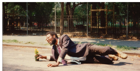
Pope.L The Great White Way 1978

How will augmented realities alter the notion of the “public”? What fantastical and disturbing new norms might emerge for these new “public spaces”? Do we need entirely new framings of our public landscape...or have we already crossed that divide? What form does this new public gathering take? How can it usher in a new era of “publics”?