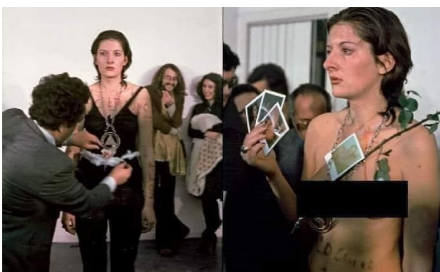
Marina Abramović Rhythm 0 , 1974

What will remain of our social signals of effort, exhaustion, and frustration? How will we raise awareness, protest, and be disruptive in an augmented landscape? What voices will be amplified, squelched out?