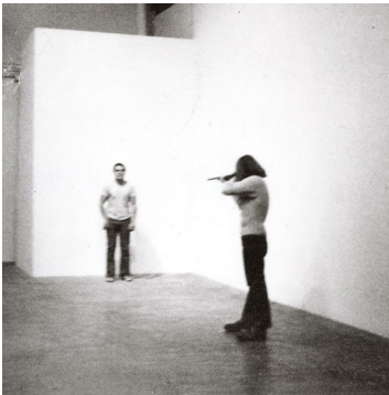
Chris Burden Shoot 1971

Presence, play, performance, emotion, truth, curiosity, flirtation, deception, distance, intimacy, life. What will social life be like as the milieu of AR technologies surround us? What new social norms will emerge? What will be the new nostalgias of social interaction? How can AR accelerate us toward equity, inclusion, and more productive social debate and engagements? How will we navigate the ethical seams and confront the fundamental new epistemological dilemmas AR will bring us? I challenge the workshop to unpack the challenges and opportunities through the lens of several artists. In particular, how a series of artists, some listed here, offer us new framings, perspectives, and a critique on the body, performance, and concepts of augmentations to everyday social life.